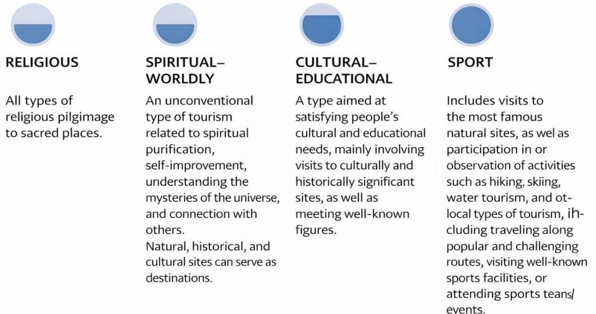
Figure 2 . Classification of pilgrimage tourism by Russian scientists

Metaphorically speaking, every journey can be a pilgrimage. If a traveler's journey during holy to places, to shrines visit if he orders, someone pilgrimage in order to if it comes she is also tourist also pilgrim is counted. This is tourism in statistics reflection It is much more difficult to define. In our opinion, given the interdependence of terms such as religious tourism, pilgrimage and tourism, it is only possible to define them by stating the specific purpose of the visit (religious tourism, pilgrimage or tourism) if the tourist clearly states the purpose of his visit. it will be possible to clarify .