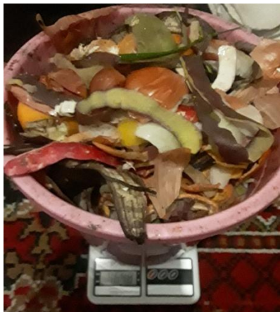
Figure 3. Weighing Process

By initially weighing food waste separated from other household waste using a scale, it is possible to calculate the potential amount of bioethanol that can be produced from a given quantity of waste.