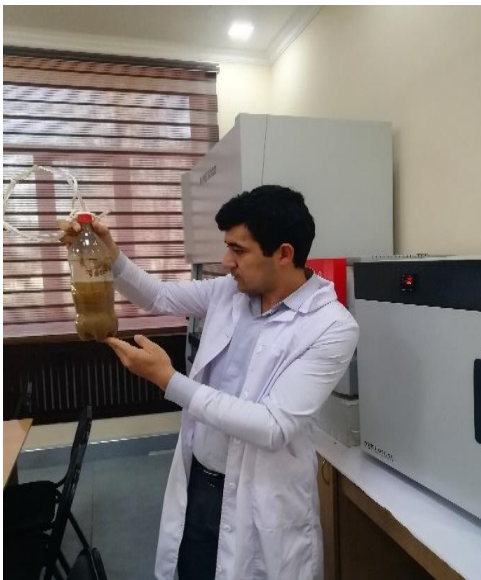
Figure 8. Monitoring of the Fermentation Process

During the experiment, 5 g of yeast ( Saccharomyces cerevisiae ) was added to 900 g of waste-derived juice. The mixture was then placed in a drying cabinet at 35°C for the fermentation process.