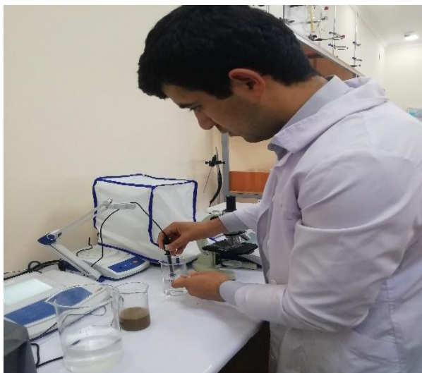
Figure 9. Measurement of the pH Level of the Solution

To promote faster growth of yeast cells during fermentation, the temperature was maintained at 35°C. The release of CO 2 during the process indicates the conversion of glucose into ethanol and carbon dioxide. The final fermentation mixture may contain water, ethanol, and other organic and inorganic compounds. The completion of fermentation is indicated by the cessation of CO 2 release.