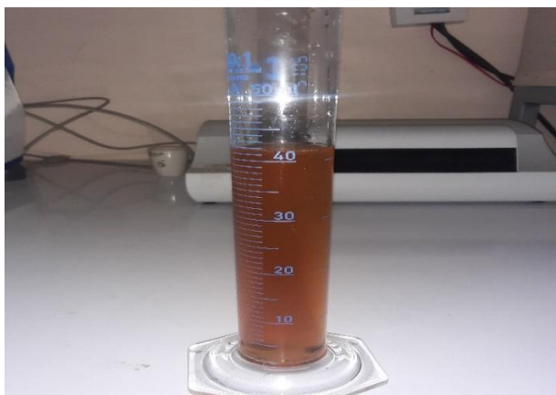
Figure 13. State of the Liquid After Treatment with Molecular Sieves