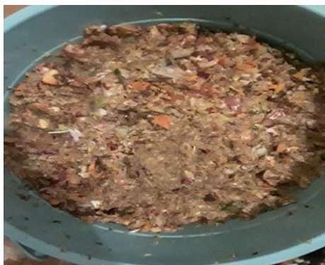
Figure 5. Shredded Waste

For the experiment, the selected and weighed food waste was first ground using a special device (chopper). The ground material was then further processed using a grinder and pressed, resulting in two separate fractions: juice and solid residue (pulp).