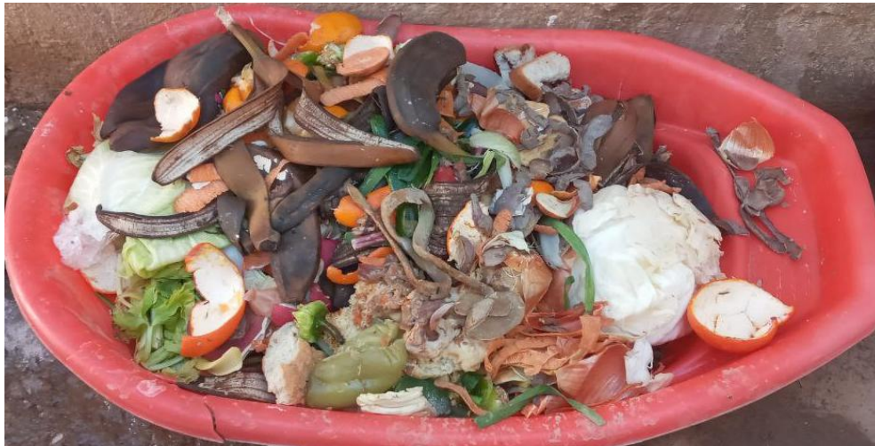
Figure 2. Collected Waste