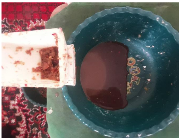
Figure 6. Juice Obtained During the Pressing Process