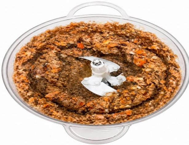
Figure 4. Grinding Process

For the experiment, the selected and weighed food waste was first ground using a special device (chopper). The ground material was then further processed using a grinder and pressed, resulting in two separate fractions: juice and solid residue (pulp).