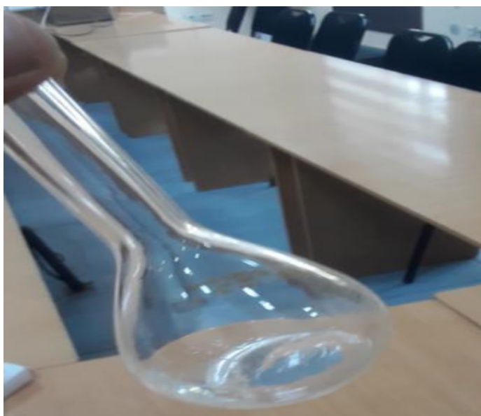
Figure 11. Liquid Collected in the Container During the Distillation Process

To further increase the bioethanol concentration in the distillate, the solution was treated with 3 Å molecular sieves. As a result, the bioethanol content increased from 9.09% to 9.13%.