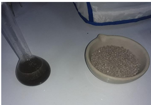
Figure 12. Treatment Process Using Molecular Sieves