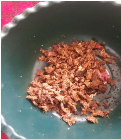
Figure 7. Pulp Obtained During the Pressing Process