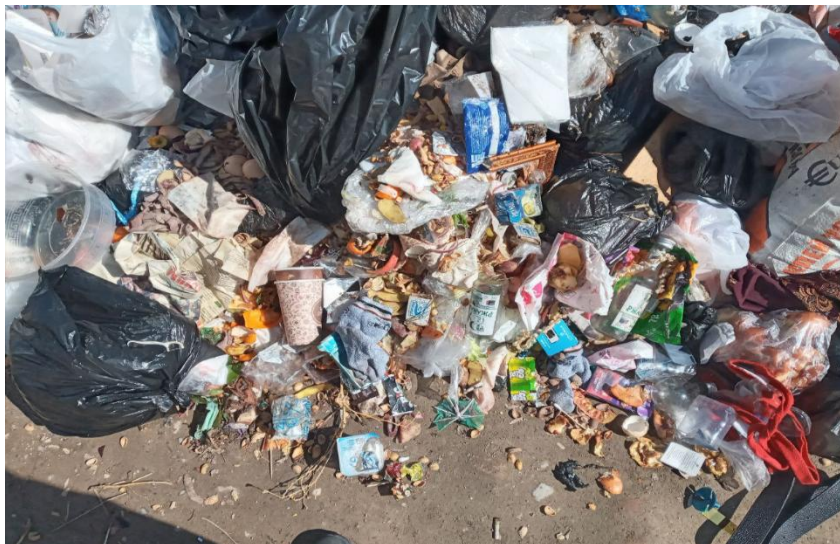
Figure 1. Condition of food waste mixed with other types of waste.

The composition of food waste is a key factor directly affecting the yield of bioethanol. Therefore, food waste requires preliminary sorting. Food waste contains polymers such as starch, cellulose, and hemicellulose. The breakdown of these polymers produces glucose, which plays a fundamental role in bioethanol production. During the fermentation process, glucose is metabolized by microorganisms, resulting in the formation of bioethanol.