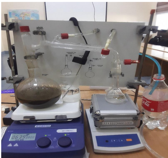
Figure 10. Distillation Process

After distillation, the obtained liquid was analyzed using an optical spectrometer in order to determine the bioethanol content. The results showed that the liquid contained 9.09% bioethanol.